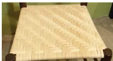
Flat reed woven seat