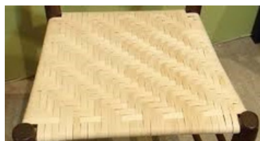
Flat reed woven seat